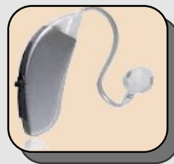
Digital Hearing Aid