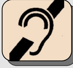
Next Advance ?