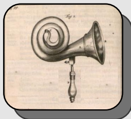
Antique Hearing Aid

"E-mail is great, but there's nothing like face-to-face conversation."